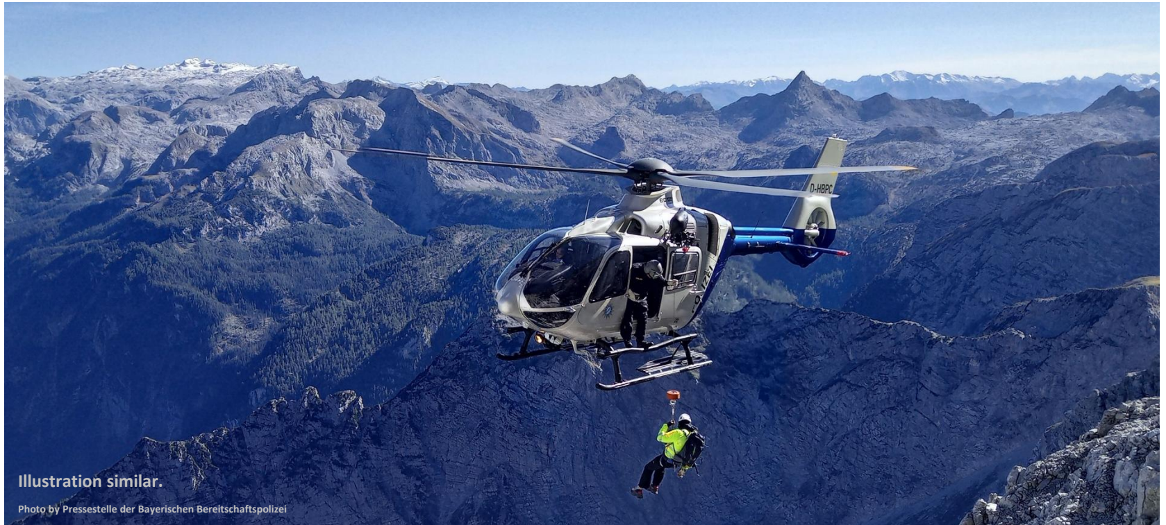
Helicopter EC 135 P 3 / D-HBPC