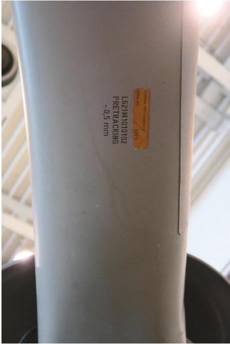
The images are for illustrative purposes only; they do not necessarily depict the aircraft being offered.