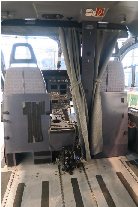
The images are for illustrative purposes only; they do not necessarily depict the aircraft being offered.